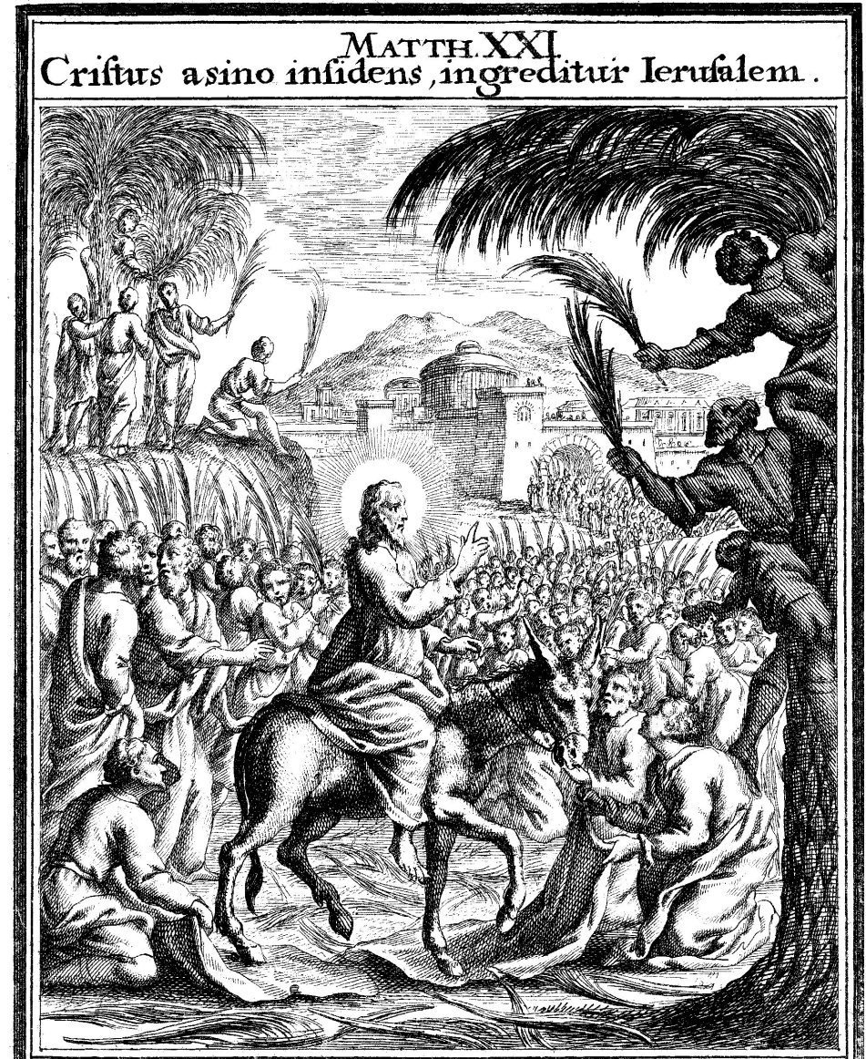
Woodcut illustration from a 1695 Bible – Matthew 21:1-11 Jesus enters Jerusalem on a donkey to the waving of palm branches and the placement of cloaks before him.